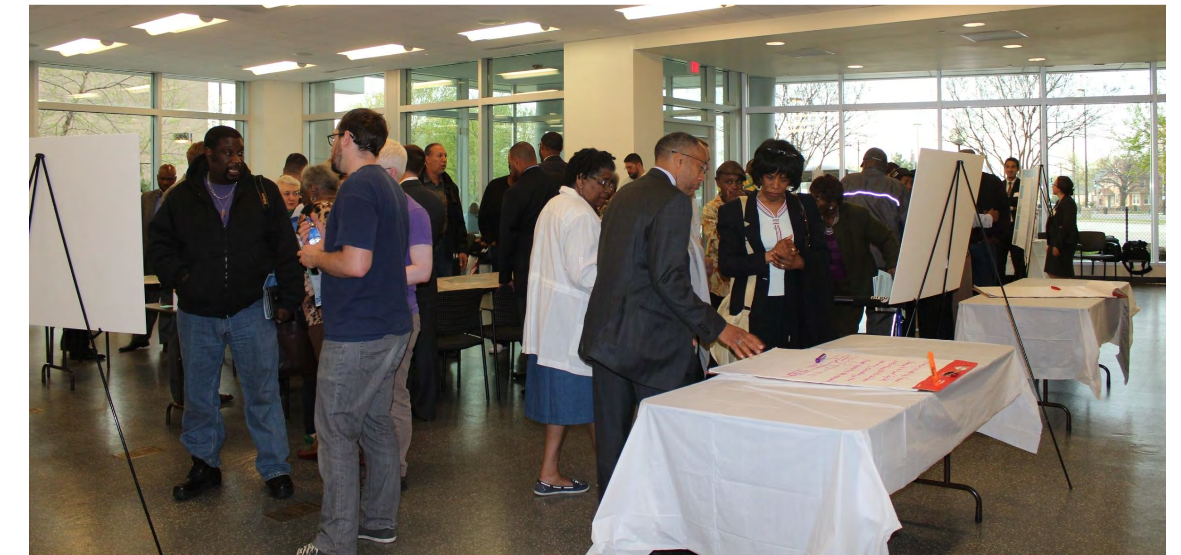
Public Scoping Meeting