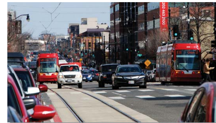
Shared-Lane Operations: H Street NE, DC