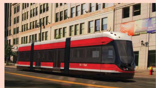
Proposed hybrid streetcars for Detroit, MI, Oklahoma City, OK and Milwaukee, WI