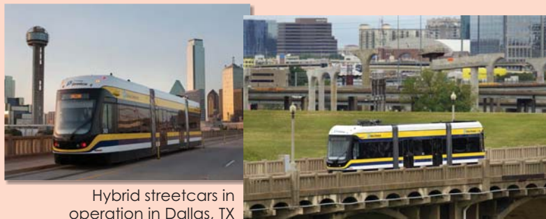
Hybrid streetcars in operation in Dallas, TX

Benefits: Minimal visual intrusion with good system performance and reliability Issues: No recharging between stops and limited application of technology